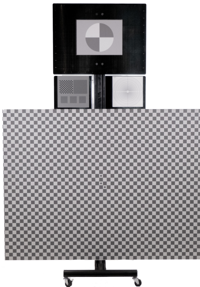
Imatest Freestanding Chart Holder