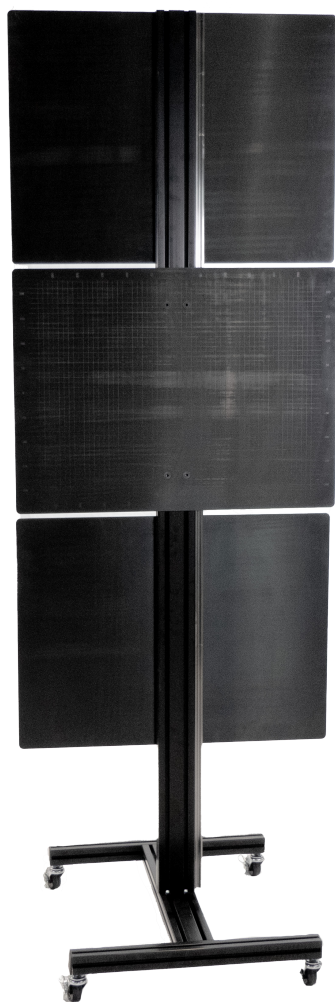
Imatest Freestanding Chart Holder